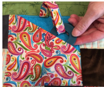
Slant pocket/tethered ring