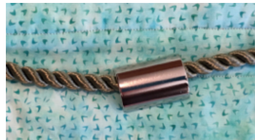
Bead on a cord

See http://coastalquilters.org/community_quilts.html for more information and photos.