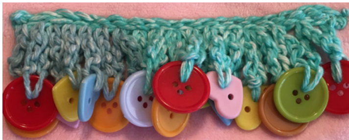
Crocheted button fringe

5. Bind the quilt. Add additional 3-dimensional elements, as desired to fill empty spaces. Add label.